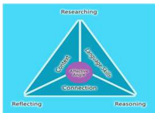
Fig. 2: The emerging PBL Language case-design model.

In conclusion, the practitioners' feedback on the trainings has provided important key points with regard to the element of ill-structuredness in crafting PBL Language cases/ problems and the emerging PBL Language Case-Design Model specifically for General English courses. Their responses are unique and crucial in view of the slight differences in case-design between language and content subjects. The convergence of new knowledge and flexibility experienced during these trainings yields a deeper understanding involving the issue of ill-structuredness for PBL language case-designs. Relatively, it contributes to a pertinent emphasis on the affective angle in the case-design procedure. The findings further conclude the importance of the emerging PBL Language Case-Design Model for language teaching and the valuable gains of the trainings in preparing PBL case-crafters to teach language using PBL cases. However, more conclusive studies might be needed before establishing the possible emerging model specifically for language subjects. Hence, the emerging PBL Language Case-Design Model is not only expected to guide English Language Practitioners with limited case-design knowledge, but also practitioners teaching other languages to craft PBL cases to meet their learners' language learning aims.